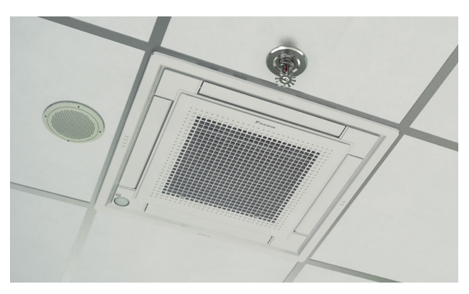
The VISTA Ceiling Cassette fits within a 2'x 2' ceiling grid and can be installed in close proximity to other building accessories.