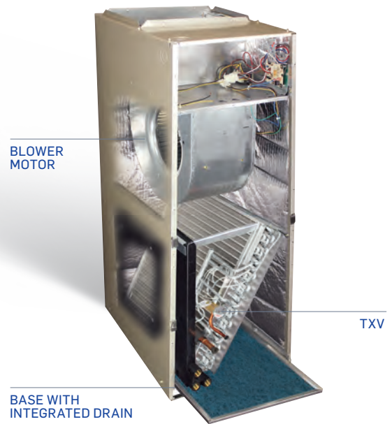
INFINITY® FE FAN COIL SHOWN

For lasting durability through corrosion protection, the indoor coil includes our high-tech composite base pan with its integrated, sloped drain. The base pan promotes positive drainage to help reduce opportunities for growth of airborne irritants. To ensure maximum reliability and energy-efficient operation, our thermostatic expansion valve (TXV) maintains proper refrigerant flow as pressure and conditions change. Of course, this is the type of excellence you expect when you turn to the experts – Carrier.